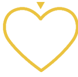
Love what we do