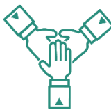
We're in it together

Send resume and covering letter to careers.france@wellsandco.com