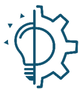
Learn to improve