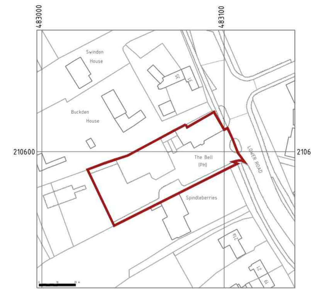
PROPOSED SITE PLAN scale 1:250